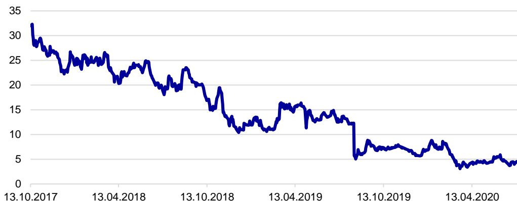
Voltabox (Xetra) in EUR